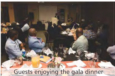
Guests enjoying the gala dinner